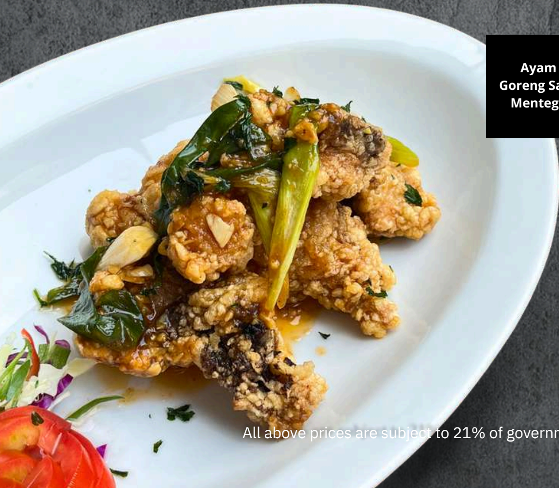
Ayam Goreng Saus Mentega

All above prices are subject to 21% of government tax and service charge